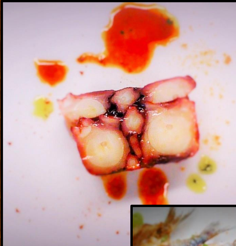
↑ OCTOPUS TERRINE, PAPRIKASH SAUCE AND SMOKED CHORIZO