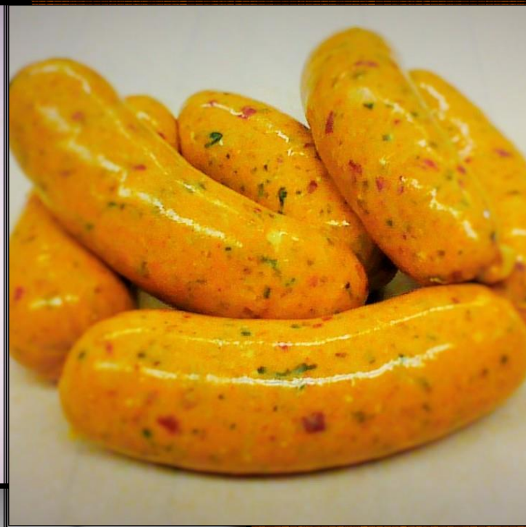
LOBSTER ~ JALAPENO ↑ SAUSAGE WITH PIQUILLO PEPPERS