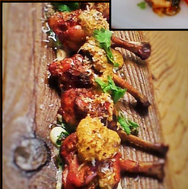
↓ TANDOORI WING DRUMETTES WITH ROARING 40'S BLUE