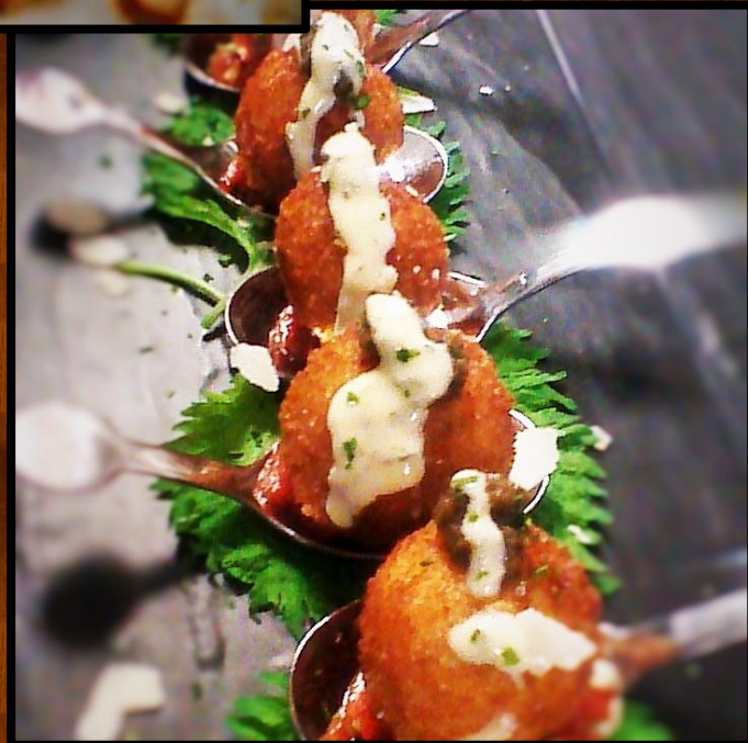
↓ ARANCINI WITH TALEGIO CREAM, CAPERS AND CHIVES