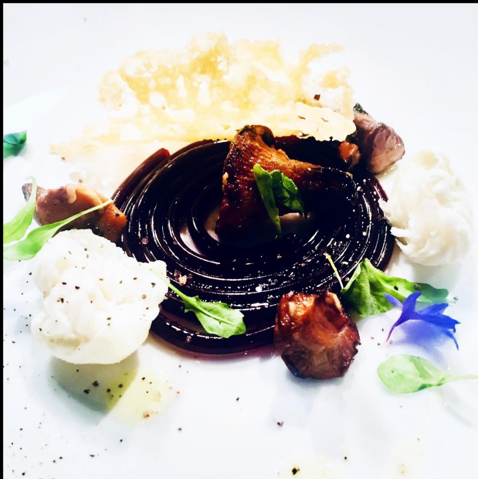
BEET GEL NOODLES WITH HAND PULLED MOZZARELLA, PARMIGIANO TUILE, SAUTEED CHANTERELLES AND CHERRY SMOKED BLACK PEPPER