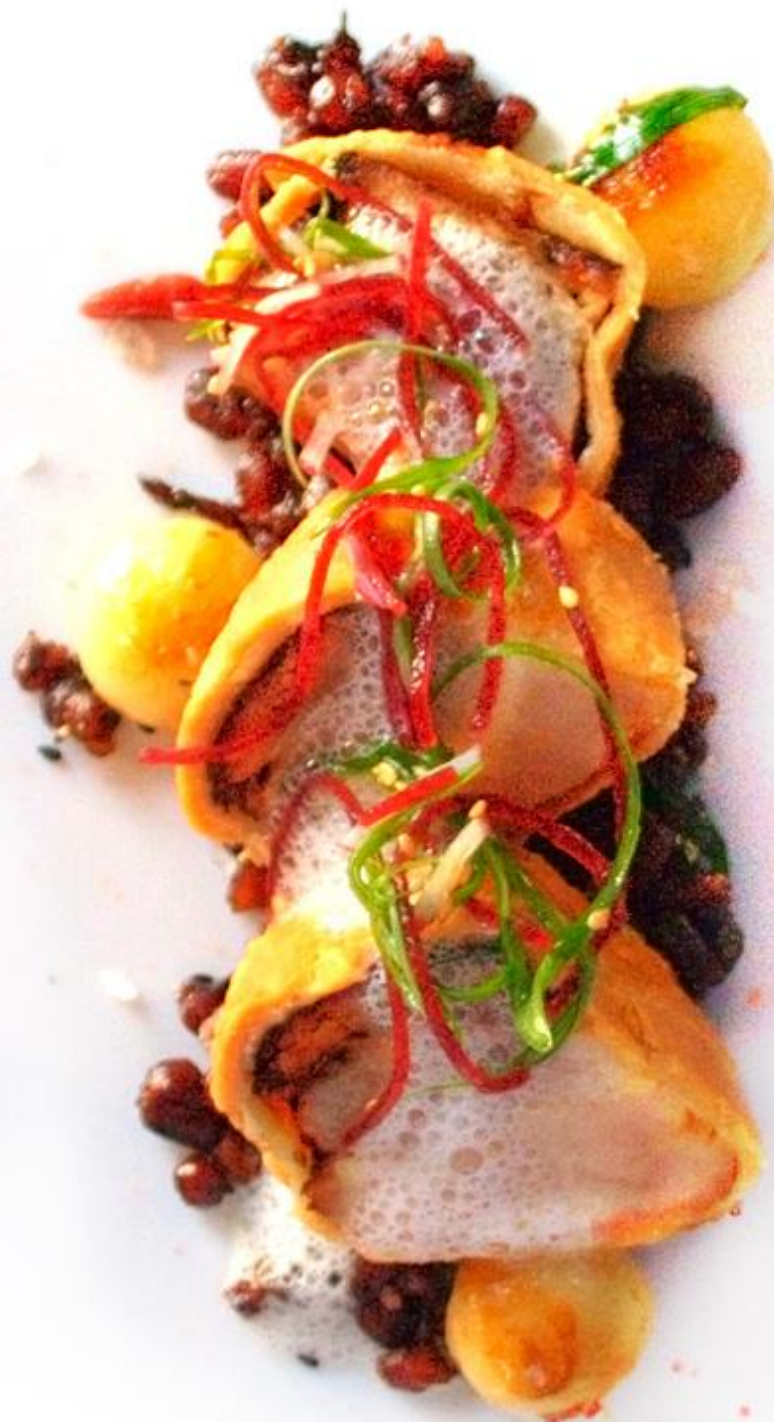
PORK BELLY IN PASTRY CRUST WITH SMOKED PORK FOAM AND SLOW COOKED ADZUKIS