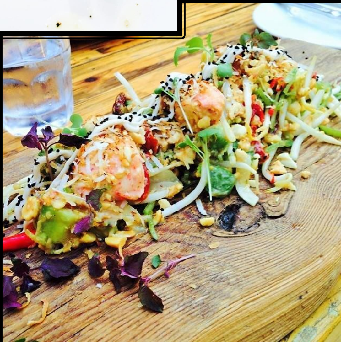
SAMOAN LOBSTER OKA WITH FRESH COCONUT, PEANUT, DRIED TOMATO, CILANTRO, SPROUTS. LIME AND PALM SUGAR THAI CHILE DRESSING