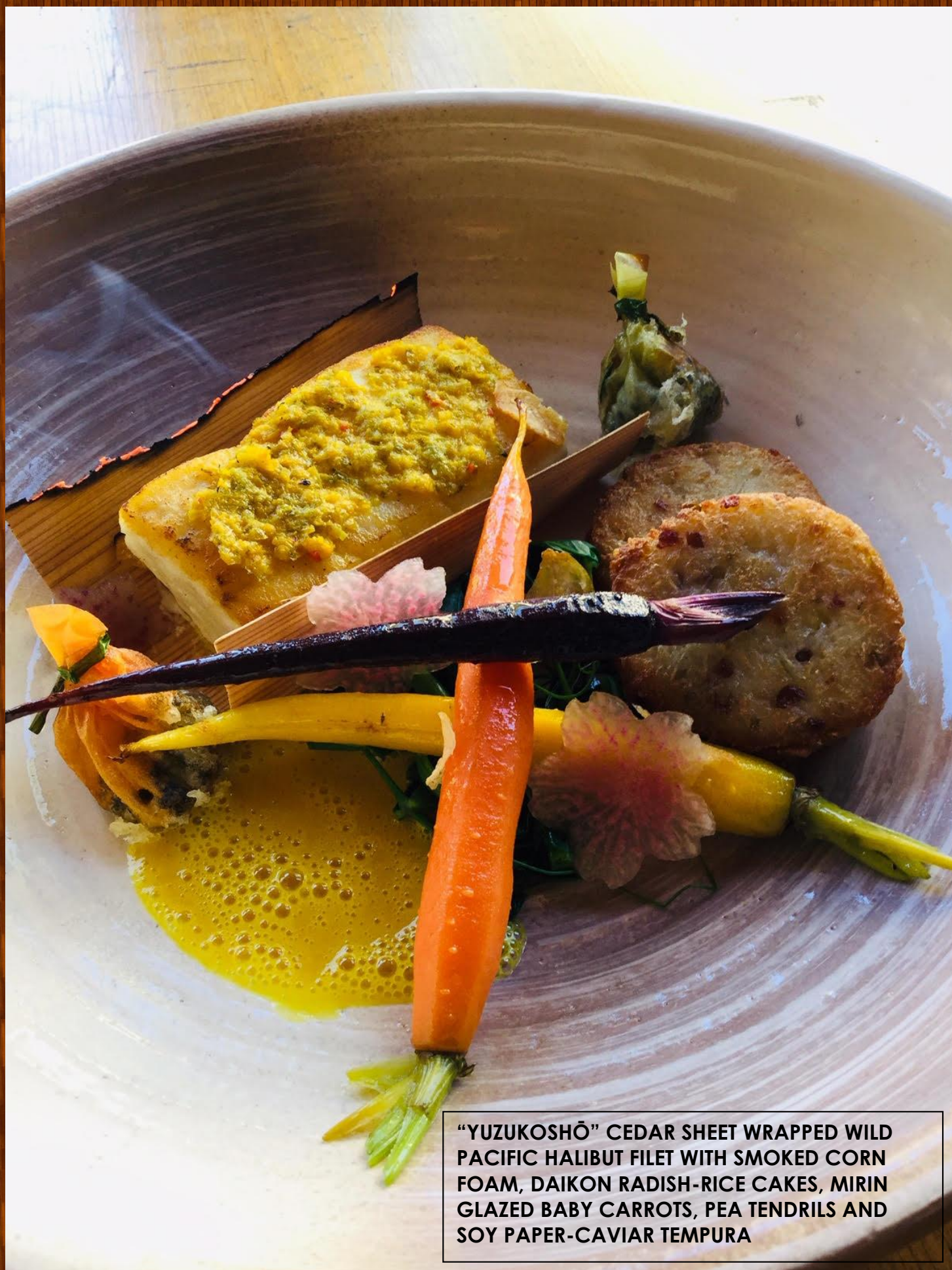
"YUZUKOSHŌ" CEDAR SHEET WRAPPED WILD PACIFIC HALIBUT FILET WITH SMOKED CORN FOAM, DAIKON RADISH-RICE CAKES, MIRIN GLAZED BABY CARROTS, PEA TENDRILS AND SOY PAPER-CAVIAR TEMPURA