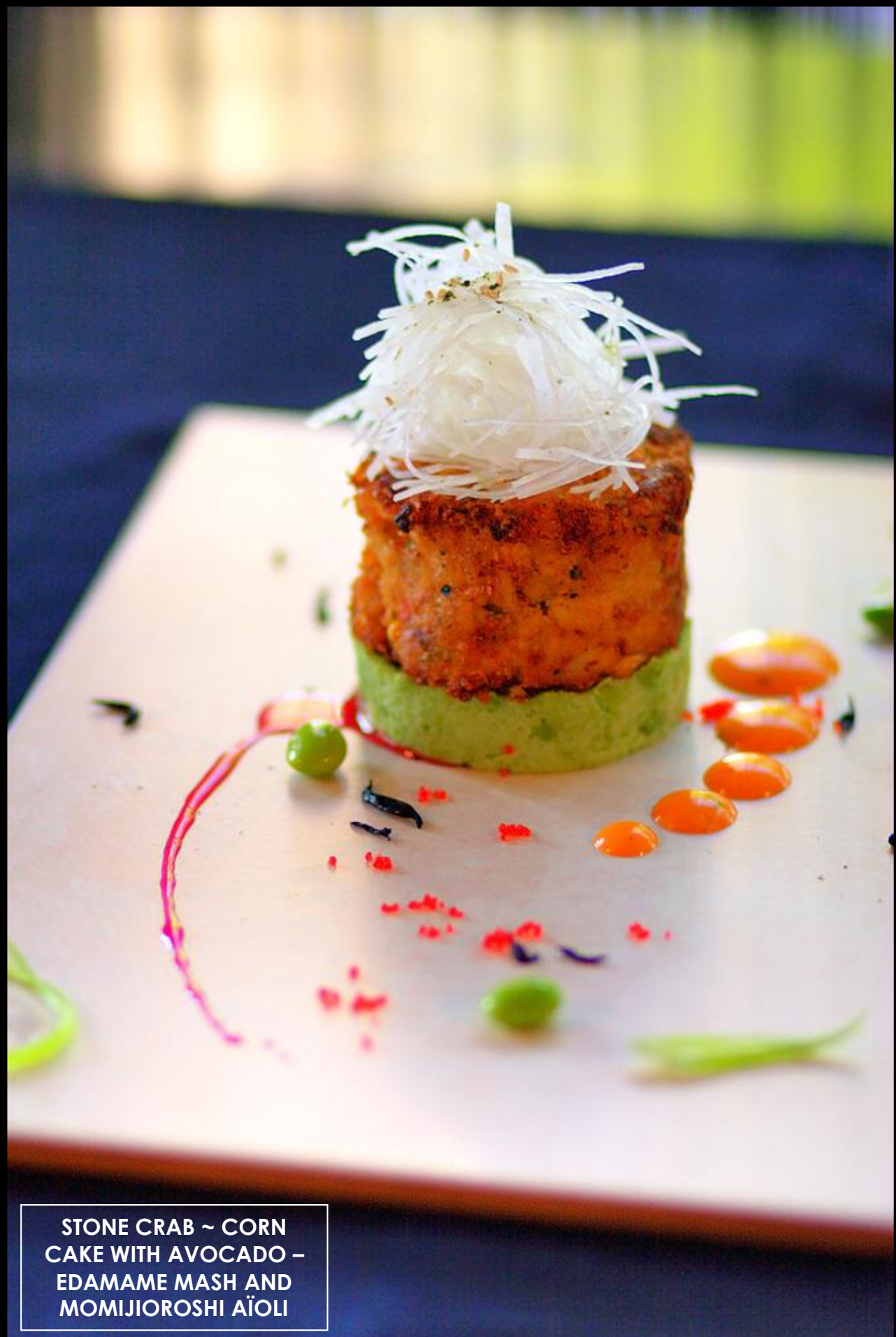
STONE CRAB ~ CORN CAKE WITH AVOCADO – EDAMAME MASH AND MOMIJIOROSHI AÏOLI