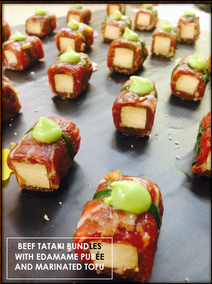
BEEF TATAKI BUNDLES WITH EDAMAME PURÉE AND MARINATED TOFU