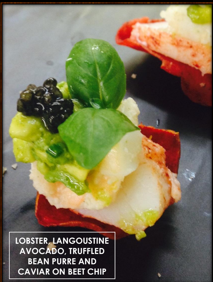
LOBSTER, LANGOUSTINE AVOCADO, TRUFFLED BEAN PURÉE AND CAVIAR ON BEET CHIP