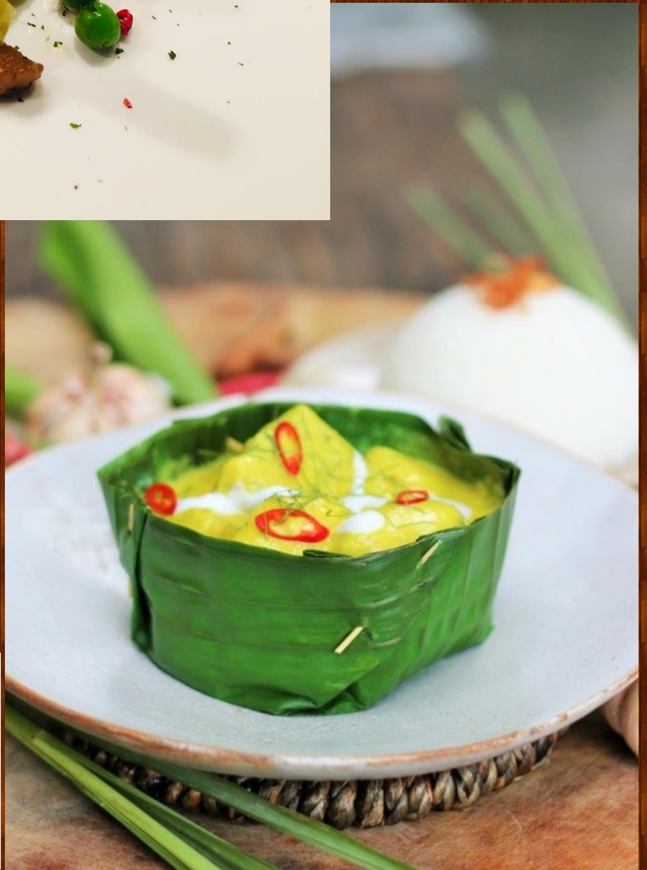
KHMER SNAKEHEAD FISH AMOK WITH YELLOW KROEUNG PASTE, COCONUT MILK, RED CHILLES, KAFFIR LIME LEAF AND FRIED GARLIC