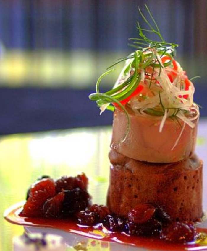
FOIE GRAS TORCHON WITH SOBA CAKE, NIGORI SAKE GELÉE AND GOJI ~ PLUM RELISH