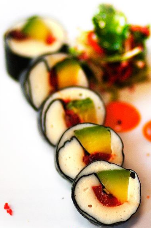
MAHIMAHI SUSHI MOUSSE WITH PIQUILLO MAYO, SQUID INK PAINT AND PICKLED ROOT SLAW