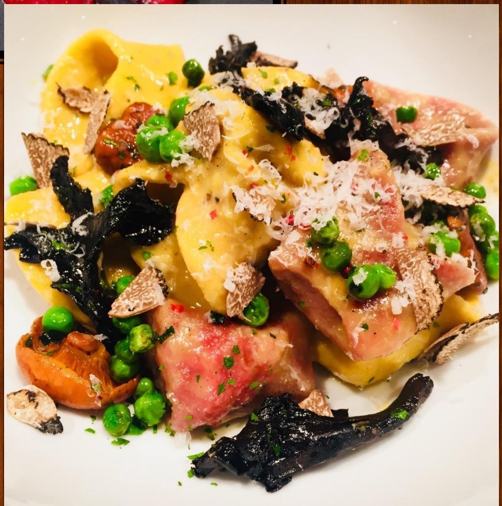
BEET & CARROT TORTELLONI WITH BRAISED PORK CHEEK, BUTTERED LEeks, TRUFFLE AND PEAS