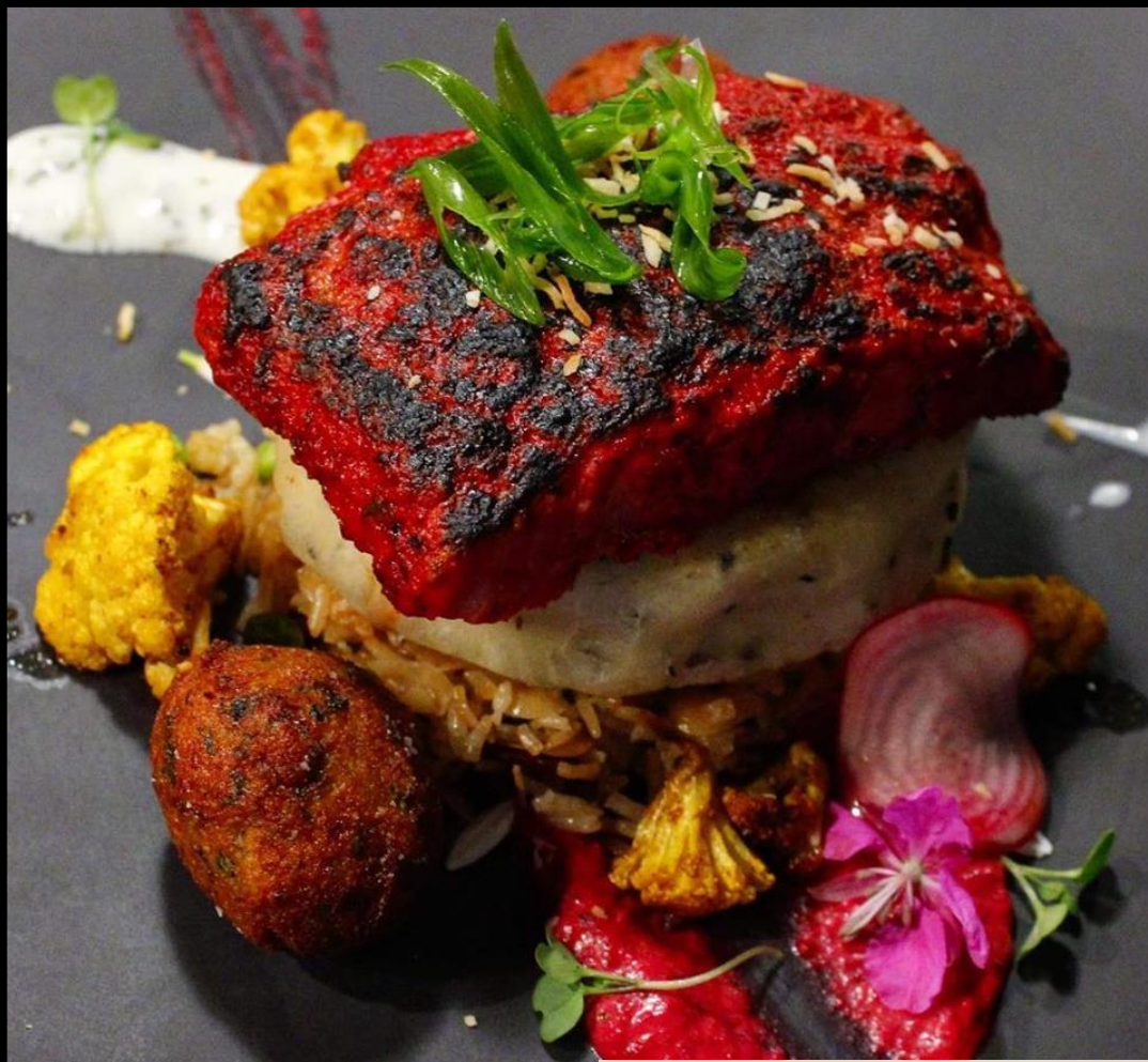
COPPER RIVER SALMON TANDOORI WITH CRAB Kofta, CUMIN NAAN, PULAO AND CAULIFLOWER MASALA