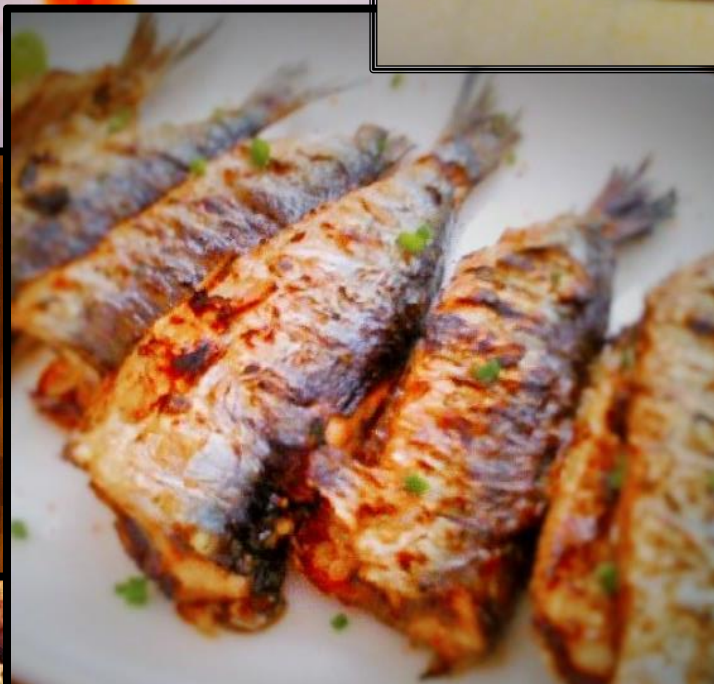
← CHAR BROILED SARDINES WITH CHILE ~ LIME SALT