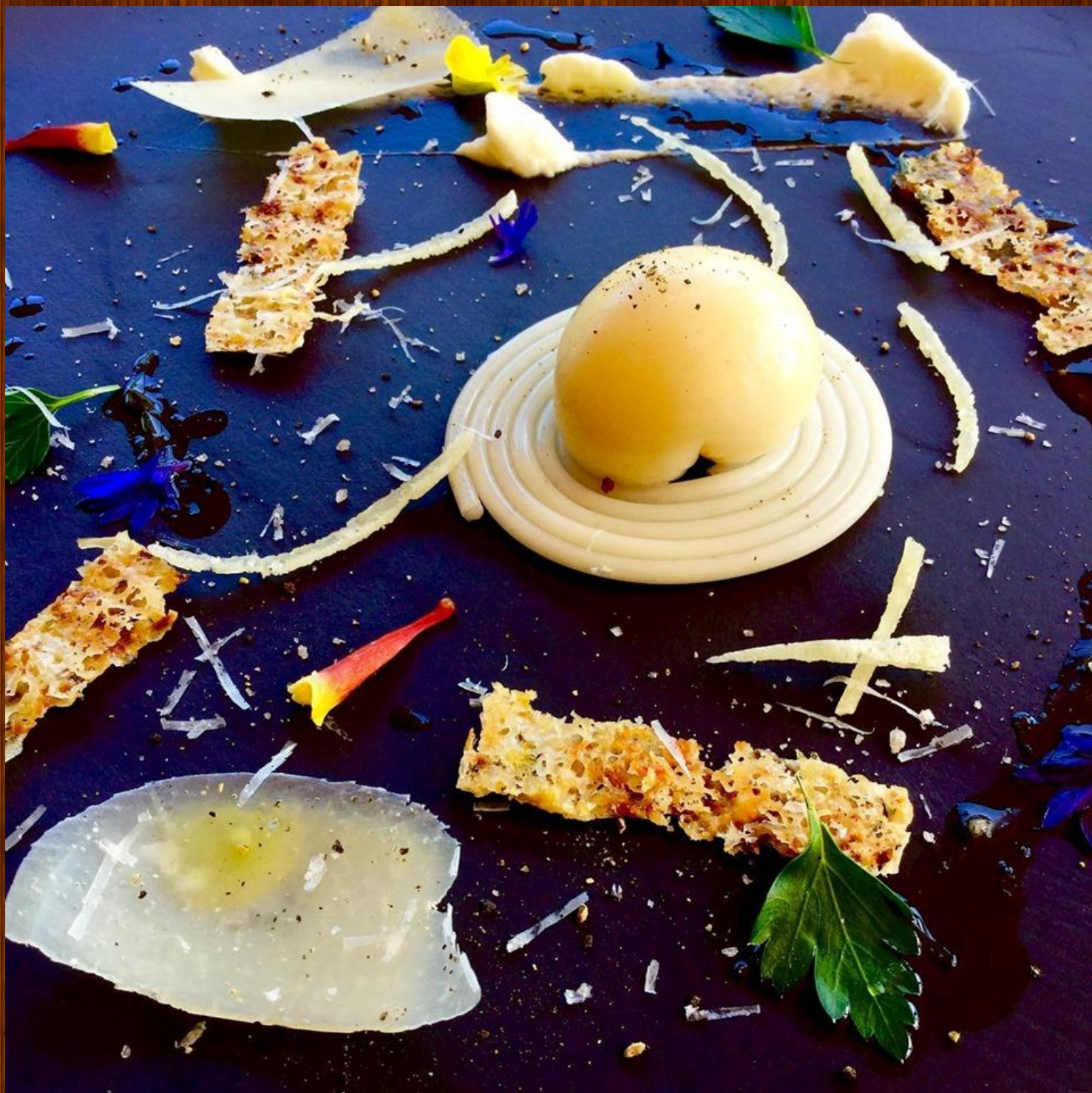
PARMIGIANO EXPOSÉ GELÉE NOODLES, WHEY PULLED CHEESE, CREMÉUX, CRISPS, DEHYDRATED AND FRESH SHAVED