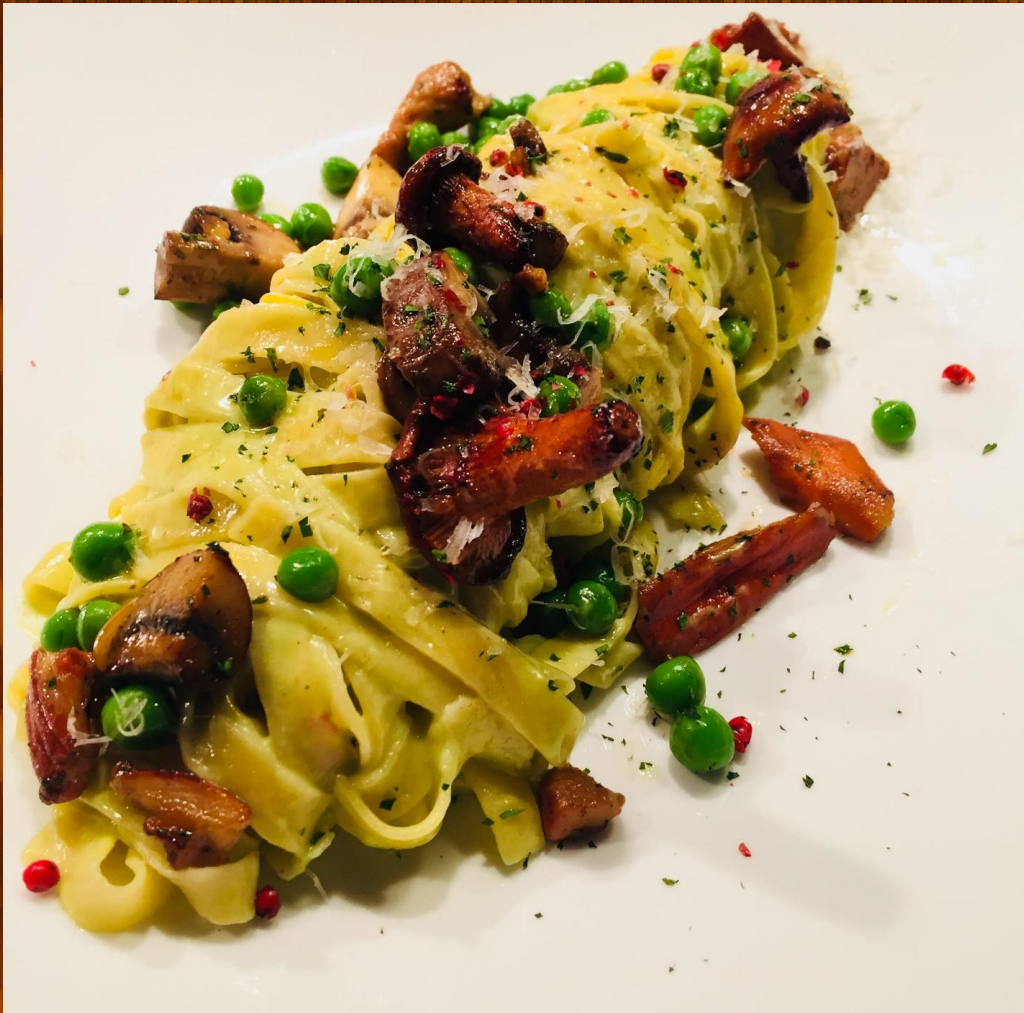
FRESH SAFFRON TAGLIATELLE WITH FORAGED CHANTERELLE MUSHROOMS, ENGLISH PEAS, PINK PEPPERCORNS AND SMOKED PECORINO ROMANO