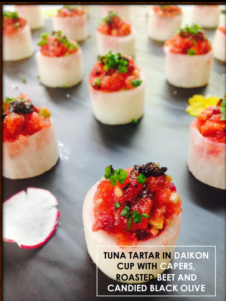
TUNA TARTAR IN DAIKON CUP WITH CAPERS, ROASTED BEET AND CANDIED BLACK OLIVE