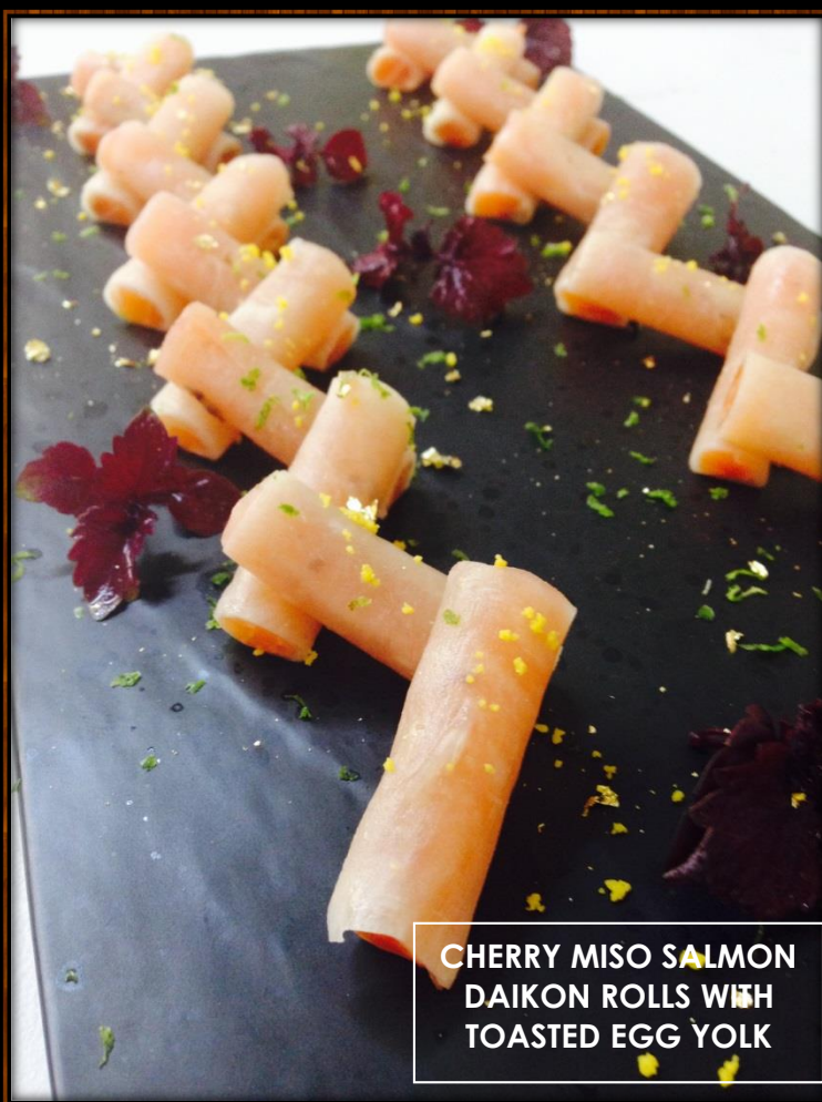
CHERRY MISO SALMON DAIKON ROLLS WITH TOASTED EGG YOLK