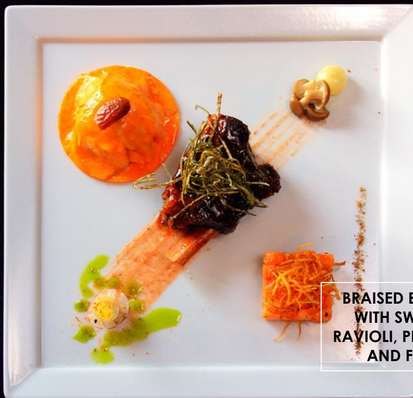
BRAISED BEEF SHORTRIB WITH SWEET POTATO RAVIOLI, PICKLED SHIMEJI AND FRIED LEEKS