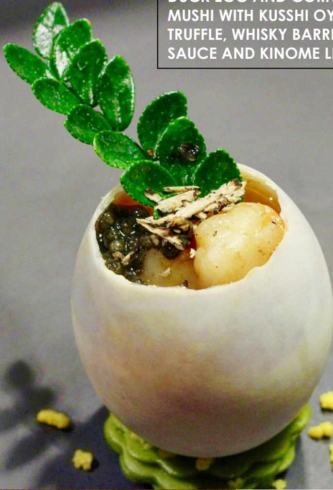
DUCK EGG AND CORN CHAWAN MUSHI WITH KUSSHI OYSTER, SHAVED TRUFFLE, WHISKY BARREL AGED SOY SAUCE AND KINOME LEAF