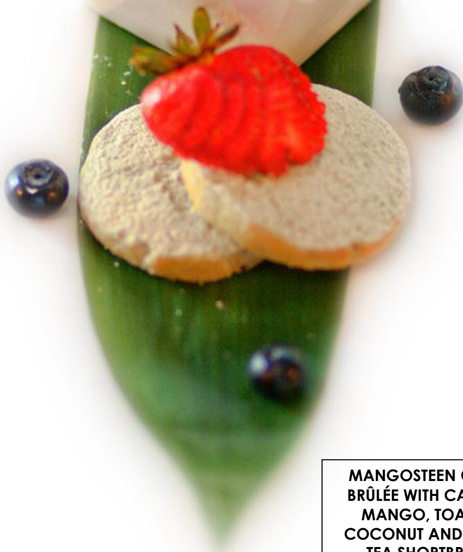
MANGOSTEEN CRÈME BRÛLÉE WITH CANDIED MANGO, TOASTED COCONUT AND GREEN TEA SHORTBREAD